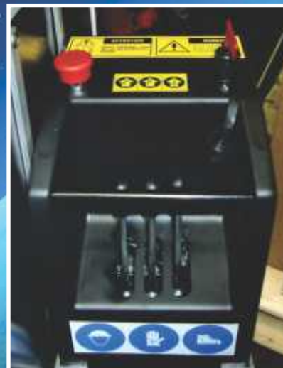
CONTROL VALVE BANK